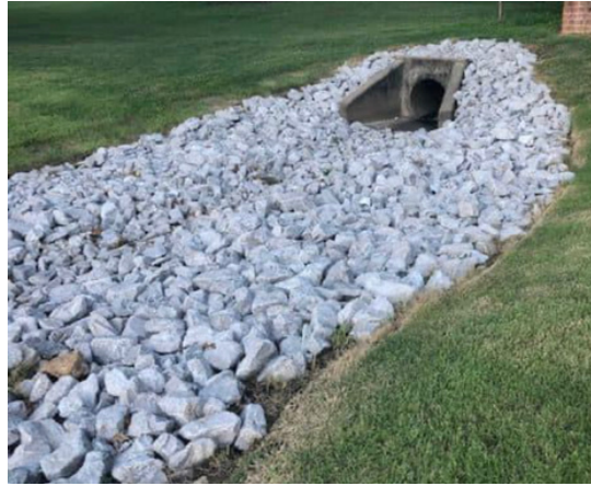
Culvert in center lake