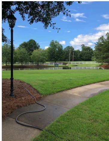
Food truck area by front lake