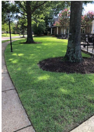
By the pool