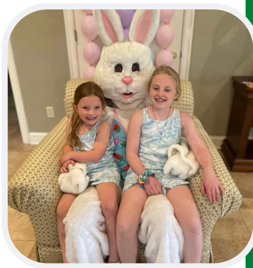
The Barnes Family